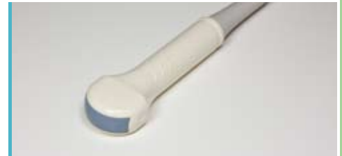
C6115H: Micro-convex, 4.5 - 7.5 MHz